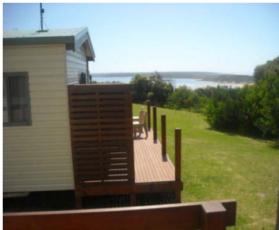
New Website for Lake Tyers Camp and Caravan Park